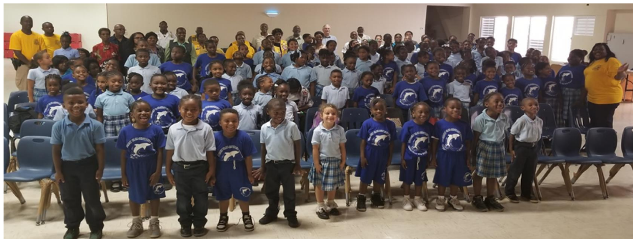
Parents, staff, and students who participated in the School Clean Up project

The 21 st CCLC Program at Lockhart Elementary School had a total attendance in 2017-2018 of 100 students, all of them (100%) identified as regular attendees. The summer program had 111 total attendees and all of them were identified as regular attendees. The 2016-2017 Local Evaluation Report for the Lockhart Elementary School 21 st CCLC Program stated the program was developed to “provide students with academic enrichment opportunities, as well as additional activities designed to complement their regular academic program. A wide range of high-quality services have been provided to support student learning and growth; including academic enrichment, intervention programs, tutorial support, counseling, homework assistance, service learning opportunities, wellness activities, as well as recreational activities to include health and fitness and a cultural program which will provide students with exposure to traditions that are part of Virgin Islands’ culture” ( Local Evaluation ). A nutritious snack that exceeded USDA guidelines was offered to all attendees. For 2017-2018, Hurricanes Irma and Maria caused difficulties for the 21 st CCLC Program. In response to information requested by state evaluators, Rhashaunda Charles-Jones, Assistant Director of the Program, provided the following information.