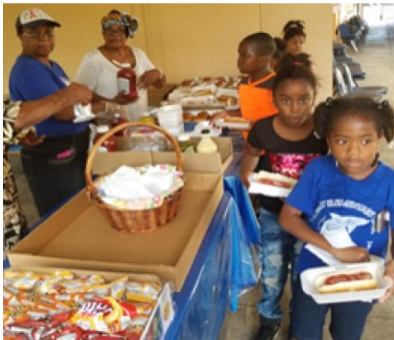
Students receiving snacks and/or a meal

Lockhart Elementary School was not critically damaged by Hurricanes Irma and Maria in September, 2017. However, since the school was used as a shelter, classes were not able to begin until November, 2017 and the 21 st CCLC Program was not started until January of 2018. However, the 21 st CCLC Program still served 100 students and all 100 were regular attendees. Students improved their academic performance, classroom participation and behavior as shown by GPRA measures.