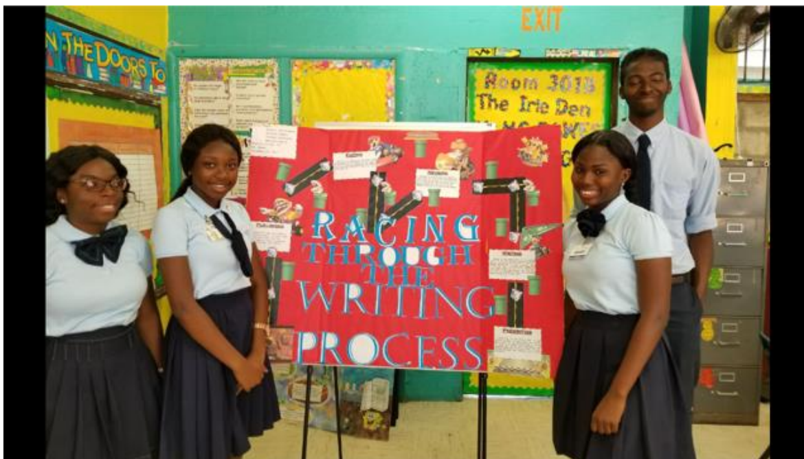
Students present their project on The Writing Process to their classmates during Language Arts

The 21 st CCLC Program at Charlotte Amalie High School had a total attendance in 2017-2018 of 222 students with 129 identified as regular attendees. The summer program had 63 total attendees and all of them were identified as regular attendees. In providing activities, the program “sought to integrate core academic subjects with a high level of fidelity through the project-based learning and teaching methods” (2014-2015 local evaluation ). A nutritious snack that met USDA guidelines was offered to all attendees although this was challenging as seen in the statement on hurricane impact below. For 2017-2018, the program was severely affected by the hurricanes in September of 2017. In response to information requested by state evaluators, Joel Buchanan, Director of the Program, provided a document titled Impact of Hurricanes Irma and Maria . He reported: