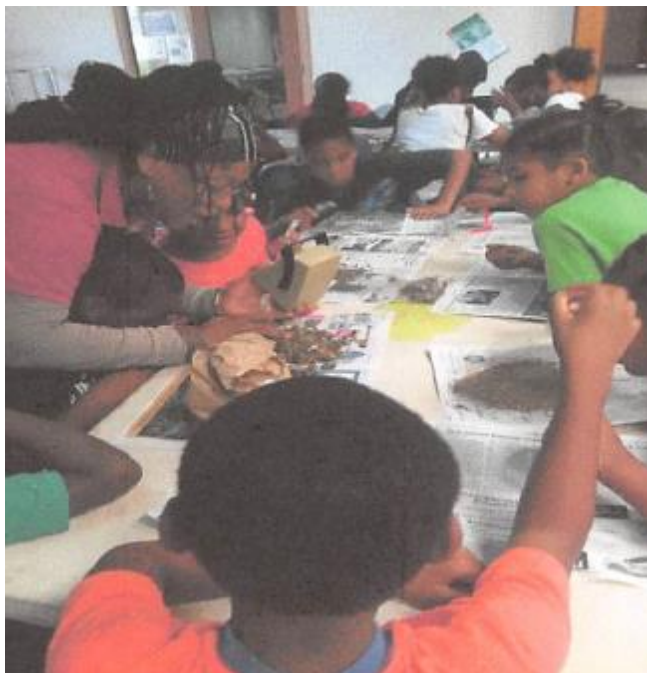
Students learning about compost

EULALIE RIVERA ELEMENTARY SCHOOL, FREDERIKSTED, ST. CROIX