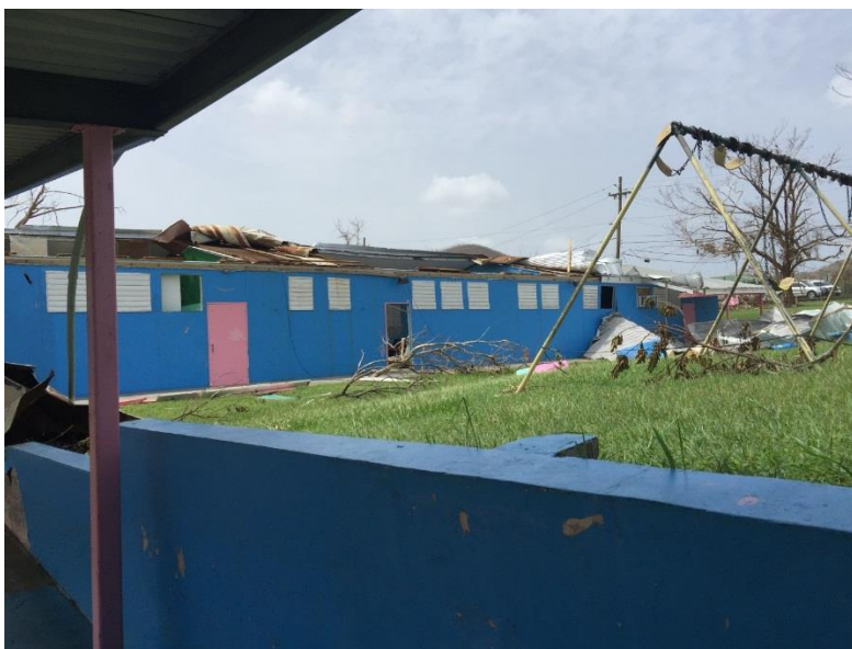
Hurricane Damage at Eulalie Rivera Elementary School