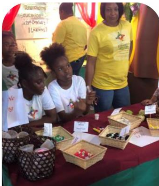
Students selling their products at the 2018 Agriculture and Food Fair.

Hurricanes Irma and Maria in September, 2017 damaged Alfredo Andrews Elementary School as well as other schools nearby. In addition, immediately after the hurricanes had passed, the 21 st CCLC location was damaged by vandals. School times were shortened and finding a new location proved to be a challenge. A site was obtained and served from February to June. Despite these challenges, the 21 st CCLC Program continued to operate and served 31 students, all of them eligible for the Free and Reduced Price Lunch and a healthy snack was served to all students in the Program. GPRA data was not available at the time of this evaluation.