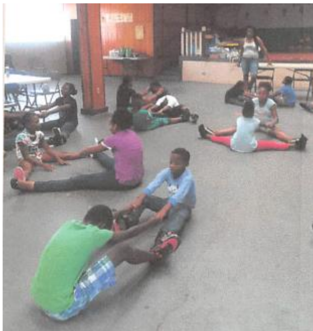
Students in morning physical activity

and used Saturdays for other activities. Data for GPRA Measures was not available but plans are in place to have data for the 2018-2019 school year.