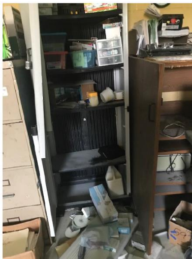
Vandalism damage that occurred after the hurricanes.