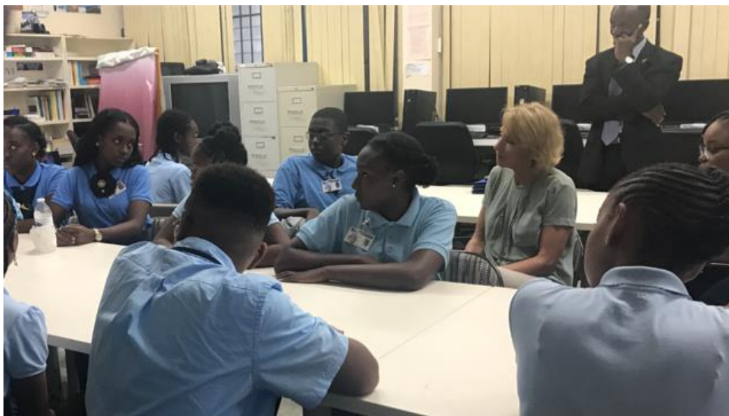
U.S. Secretary of Education DeVos listens intently as students discuss the impact of the storms.

Our summer camp program, aptly dubbed ESCAPE provided an outlet for about 40 students (half the number of students who usually sign up for our summer program). The struggle continues – we may be down but definitely – not out.