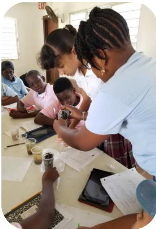
Students engaged in science water treatment experiment.