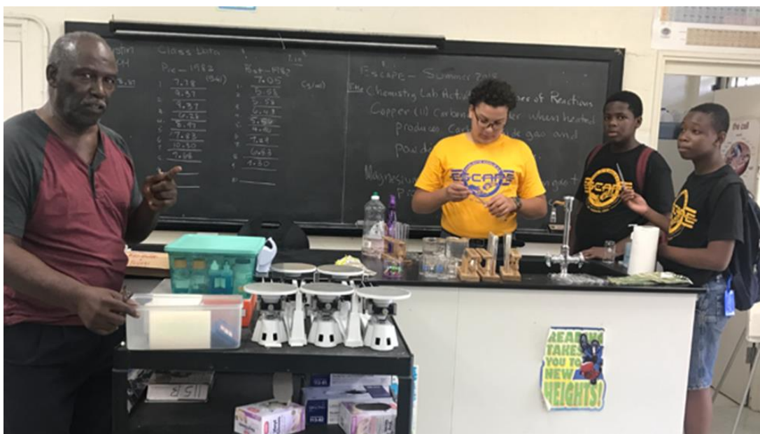
Students engaged in a series of inquiry-based STEM lab activities

After the devastation of Hurricanes Irma and Maria in September, 2017 Charlotte Amalie High School had many challenges, including the 21 st CCLC Program. For example, the loss of electricity caused much of the food supplies for the 21 st CCLC program to be discarded. In addition, the program could only be held during daylight hours and the school facilities were shared with students from the feeder junior high school, resulting in the high school students attending classes for only half a day. Enrollment was down by approximately 40% due to many families leaving the Virgin Islands. Despite these challenges, the 21 st CCLC Program continued and provided services needed by students, families, and the community. Students improved their academic performance as shown by GPRA measures.