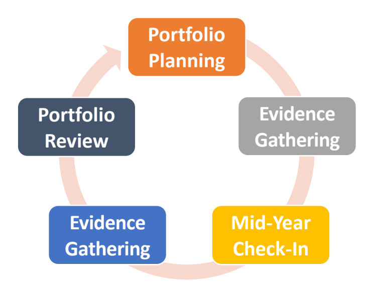
Figure 1: The Portfolio Process. This figure displays the portfolio process for all coordinators in the U.S. Virgin Islands.